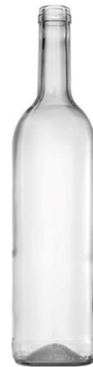
BN1442 F 750ml Mead Bottle to be used for rest of mead classes