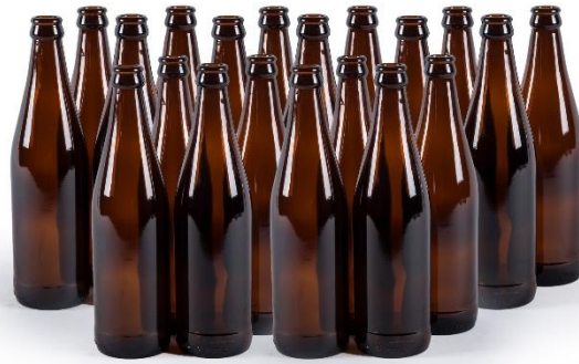
Consol craft beer bottle – 440ml to be used for Brewed and low alcohol pettilant mead class