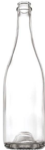
BN608F 750ml Sparkling Mead bottle to be used for Sparkling mead