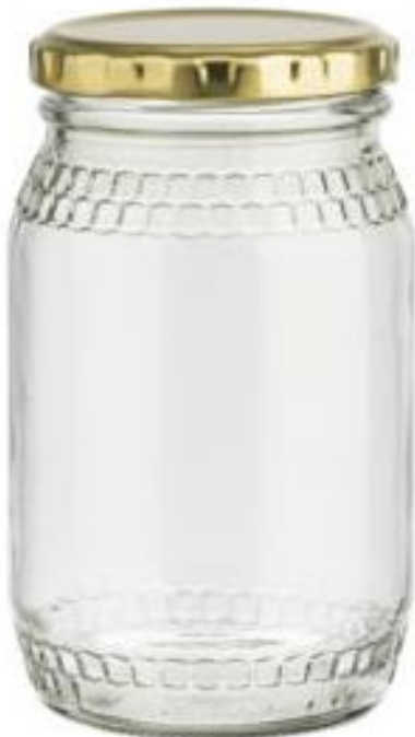
352ml Consol Honey Jar = 500g

500g CONSOL type Honey bottle. Fill level as indicated in the diagram. New gold lid without dents and scratches. Gold colour may vary – do check them. There should be no markings on the bottle. Remove the factory black manufacture date (if any) underneath or on the side of the bottle with alcohol. Lids won’t be changed by the chief steward before the competition. Allowances for courier spill inside the lids will be made.