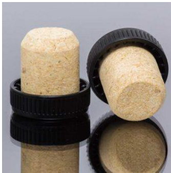
Flange Cork T-tops